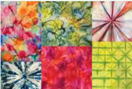
Judy Coates Perez

Ink, Print, Repeat: Exploration in textile pattern design using acrylic inks