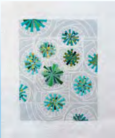
Marge Tucker, Session 3