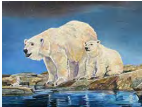
Sandra Mollon, Session 1

43 professional instructors share their talents during 5 inspiring sessions in 1 legendary location... Asilomar!