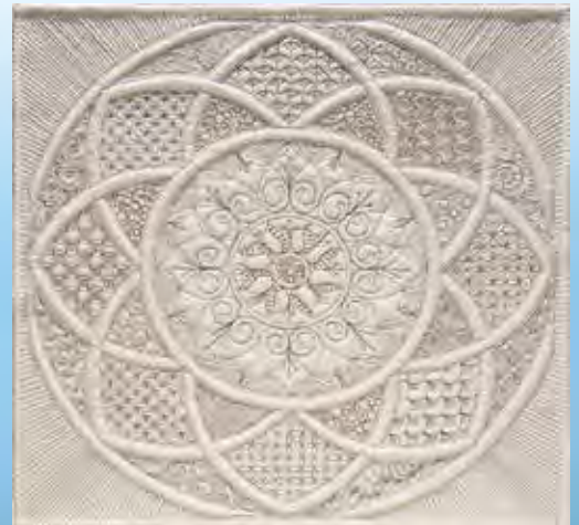
Sue Heinz, Session 5